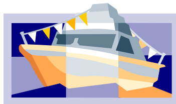
A PEG Partner... ship!